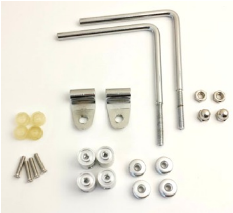
Contents of fitting kit