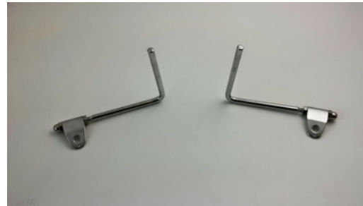
3) Assemble the mounting arms as shown.