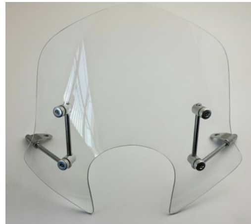
4) Mount the screen as shown loosely onto the mirror posts. Tweak the mounting brackets if necessary. Tighten all screws and nuts. Ensure the screen is not rubbing on the headlight surround.