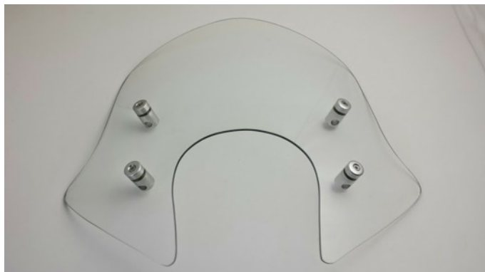
2) Assemble the aluminium mounts as shown.