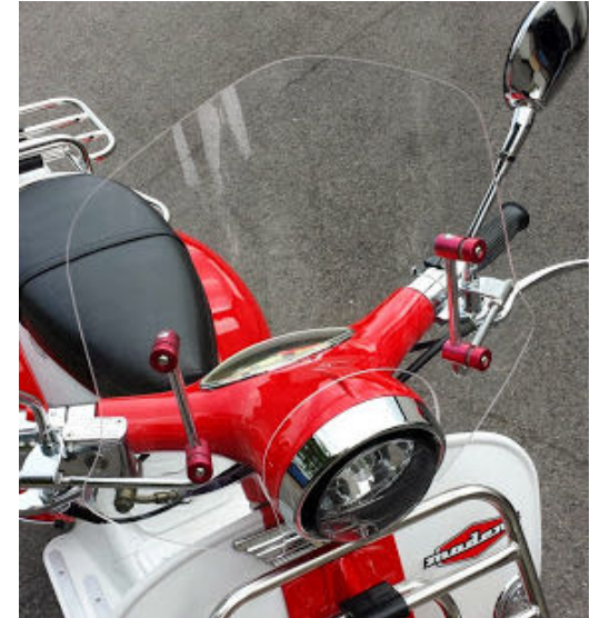
5) The screen fitted.

For technical help, contact your AJS Dealer or call AJS Motorcycles Ltd. 01264 365 103